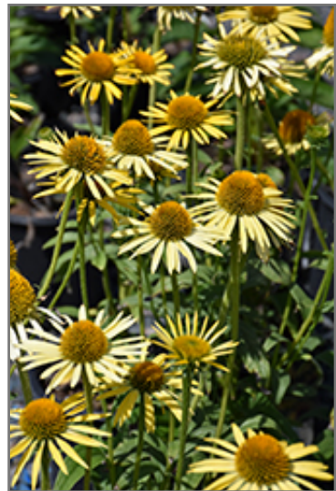
Maui Sunshine Coneflower flowers