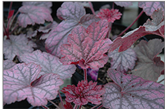
Midnight Bayou Coral Bells foliage

Midnight Bayou Coral Bells is recommended for the following landscape applications;