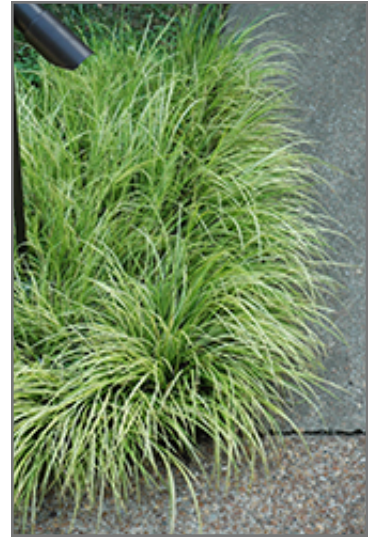
Grassy-Leaved Sweet Flag

Grassy-Leaved Sweet Flag is a fine choice for the garden, but it is also a good selection for planting in outdoor pots and containers. It is often used as a 'filler' in the 'spiller-thriller-filler' container combination, providing a canvas of foliage against which the larger thriller plants stand out. Note that when growing plants in outdoor containers and baskets, they may require more frequent waterings than they would in the yard or garden.