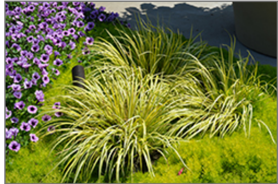
Grassy-Leaved Sweet Flag

Grassy-Leaved Sweet Flag is recommended for the following landscape applications;