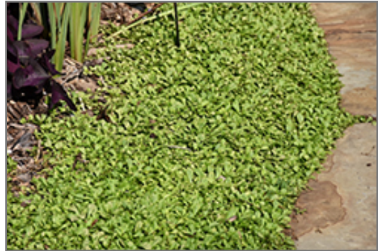
Creeping Mazus

Creeping Mazus is a fine choice for the garden, but it is also a good selection for planting in outdoor pots and containers. Because of its spreading habit of growth, it is ideally suited for use as a 'spiller' in the 'spiller-thriller-filler' container combination; plant it near the edges where it can spill gracefully over the pot. Note that when growing plants in outdoor containers and baskets, they may require more frequent waterings than they would in the yard or garden.