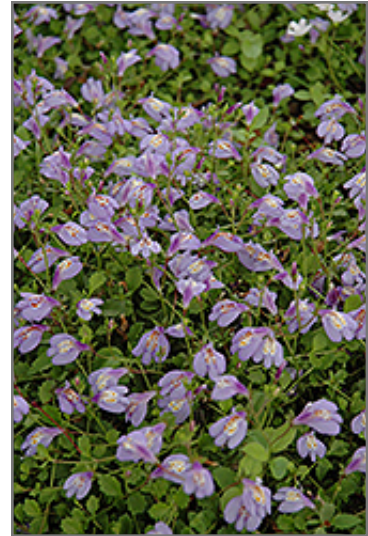
Creeping Mazus flowers