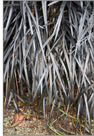
Black Mondo Grass foliage

Black Mondo Grass is a fine choice for the garden, but it is also a good selection for planting in outdoor pots and containers. It is often used as a 'filler' in the 'spiller-thriller-filler' container combination, providing a mass of flowers and foliage against which the thriller plants stand out. Note that when growing plants in outdoor containers and baskets, they may require more frequent waterings than they would in the yard or garden.