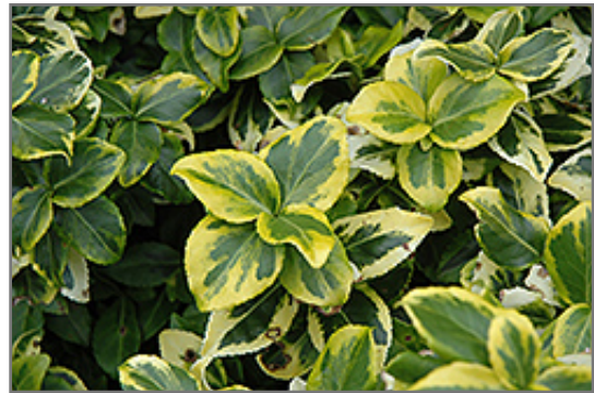
Gold Prince Wintercreeper foliage