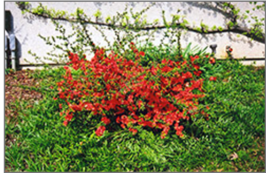
Common Flowering Quince in bloom

This is a high maintenance shrub that will require regular care and upkeep, and should only be pruned after flowering to avoid removing any of the current season's flowers. Gardeners should be aware of the following characteristic(s) that may warrant special consideration;