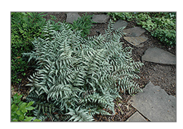
Japanese Painted Fern

A rare departure from the deep greens of the shade garden with seemingly hand painted airy fronds; the silvery tips almost seem metallic; truly a visual feast for the shaded areas of the garden