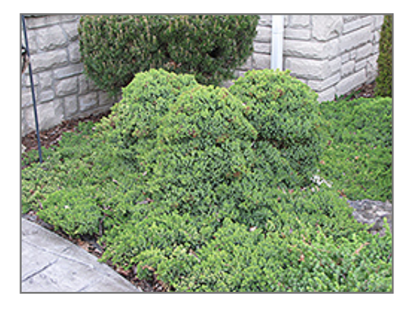
Dwarf Japanese Garden Juniper

Dwarf Japanese Garden Juniper is a dense multi-stemmed evergreen shrub with a ground-hugging habit of growth. It lends an extremely fine and delicate texture to the landscape composition which should be used to full effect.