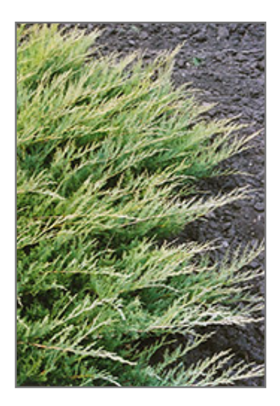
Broadmoor Juniper foliage