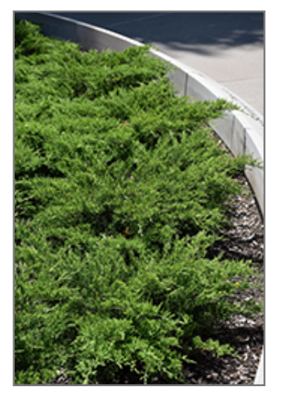
Broadmoor Juniper