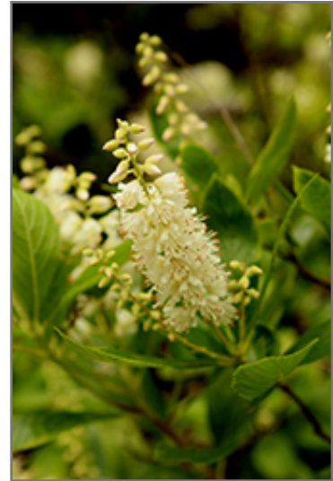
Summersweet flowers

Summersweet is recommended for the following landscape applications;