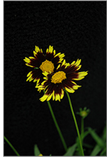
Cosmic Eye Tickseed flowers

Cosmic Eye Tickseed is recommended for the following landscape applications;