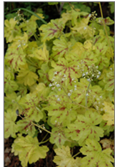
Solar Power Foamy Bells flowers