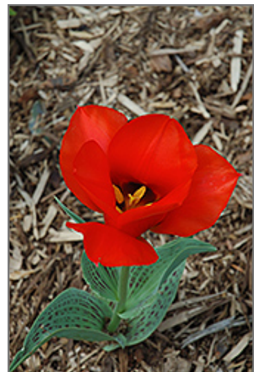
Casa Grande Tulip flowers