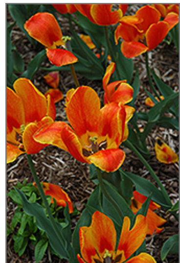
Flair Tulip flowers