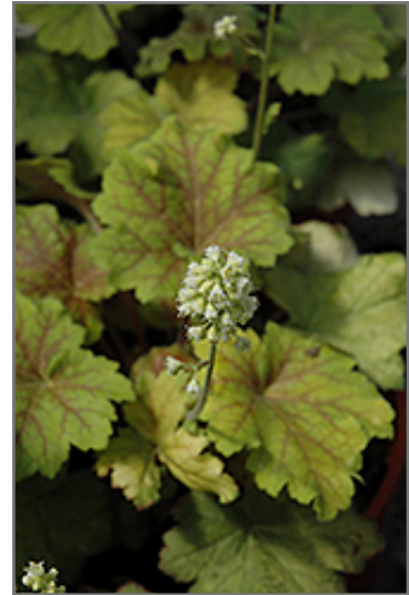
Electra Coral Bells flowers

Electra Coral Bells is recommended for the following landscape applications;