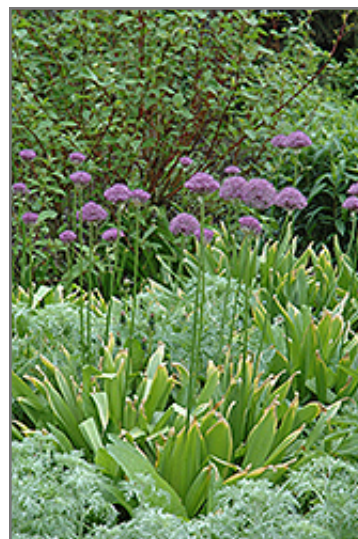
Purple Sensation Ornamental Onion in bloom