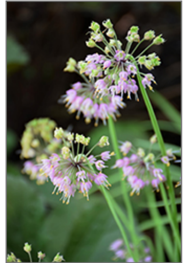
Nodding Onion flowers

This plant should only be grown in full sunlight. It does best in average to evenly moist conditions, but will not tolerate standing water. It is not particular as to soil type or pH, and is able to handle environmental salt. It is highly tolerant of urban pollution and will even thrive in inner city environments. This species is native to parts of North America. It can be propagated by multiplication of the underground bulbs.