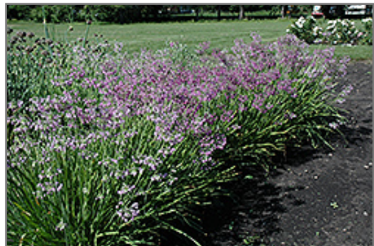
Nodding Onion in bloom