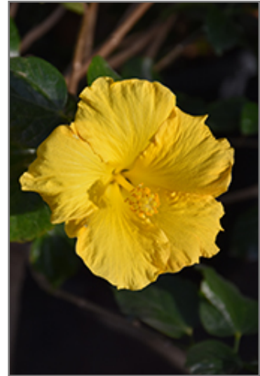
Yellow Hibiscus flowers

When grown indoors, Yellow Hibiscus can be expected to grow to be about 5 feet tall at maturity, with a spread of 4 feet. It grows at a fast rate, and under ideal conditions can be expected to live for approximately 5 years. This houseplant will do well in a location that gets either direct or indirect sunlight, although it will usually require a more brightly-lit environment than what artificial indoor lighting alone can provide. It requires an evenly moist well-drained soil for optimal growth, but will suffer if left to grow in standing water. The surface of the soil shouldn't be allowed to dry out completely, and so you should expect to water this plant once and possibly even twice each week. Be aware that your particular watering schedule may vary depending on its location in the room, the pot size, plant size and other conditions; if in doubt, ask one of our experts in the store for advice. It is not particular as to soil type or pH; an average potting soil should work just fine.