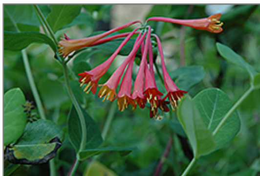
Alabama Scarlet Trumpet Honeysuckle flowers