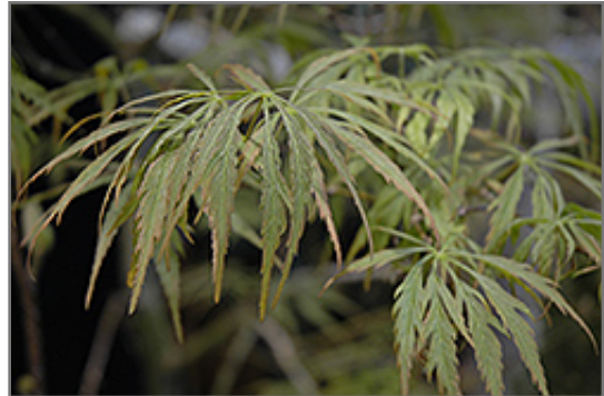
Crimson Princess Japanese Maple foliage