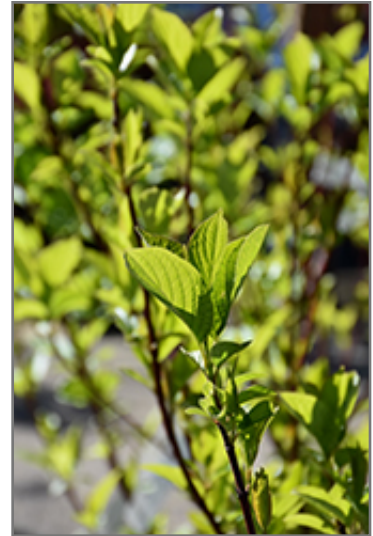
Bailey Red-Twig Dogwood foliage

This shrub does best in full sun to partial shade. It is an amazingly adaptable plant, tolerating both dry conditions and even some standing water. It is not particular as to soil type or pH. It is highly tolerant of urban pollution and will even thrive in inner city environments. This species is native to parts of North America.