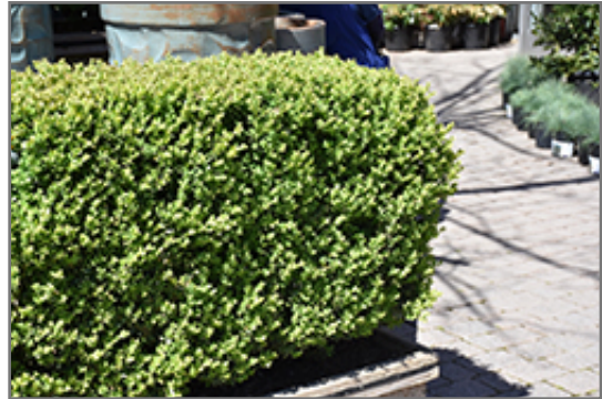
Green Mountain Boxwood