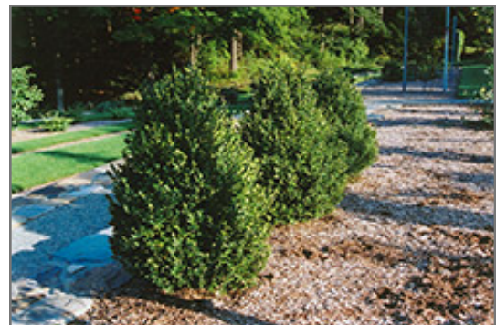
Green Mountain Boxwood