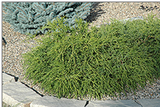
Mops Falsecypress