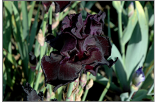
Before The Storm Iris flowers