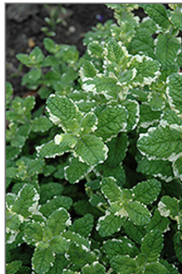
Variegated Pineapple Mint foliage

Variegated Pineapple Mint features bold spikes of white flowers rising above the foliage in mid summer. Its attractive fragrant pointy leaves remain green in color with distinctive creamy white edges throughout the season.