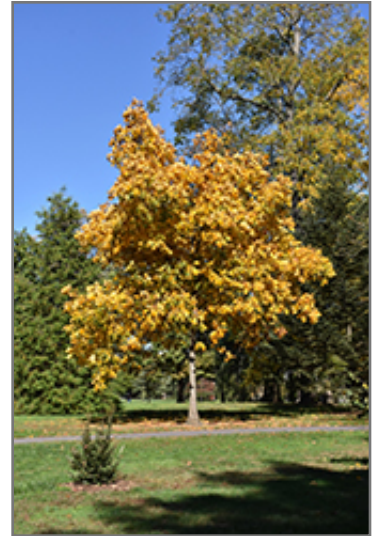
Shagbark Hickory in fall

This tree does best in full sun to partial shade. It is very adaptable to both dry and moist locations, and should do just fine under average home landscape conditions. It is not particular as to soil pH, but grows best in rich soils. It is somewhat tolerant of urban pollution. This species is native to parts of North America.