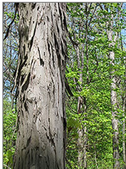
Shagbark Hickory bark