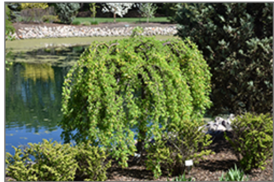
Weeping Peashrub

Weeping Peashrub is recommended for the following landscape applications;