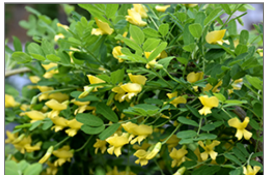
Weeping Peashrub flowers