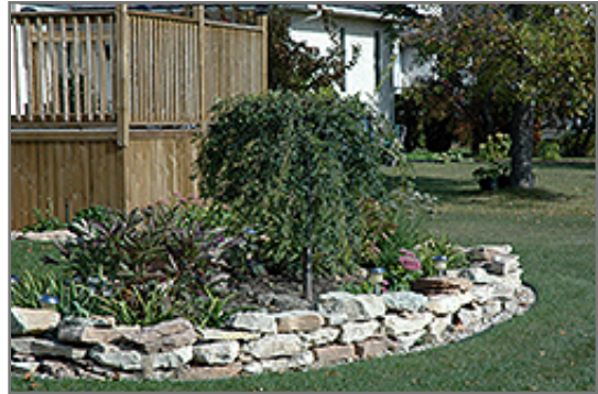
Weeping Peashrub

This shrub does best in full sun to partial shade. It prefers dry to average moisture levels with very well-drained soil, and will often die in standing water. It is considered to be drought-tolerant, and thus makes an ideal choice for xeriscaping or the moisture-conserving landscape. It is not particular as to soil type or pH, and is able to handle environmental salt. It is highly tolerant of urban pollution and will even thrive in inner city environments. This is a selected variety of a species not originally from North America.