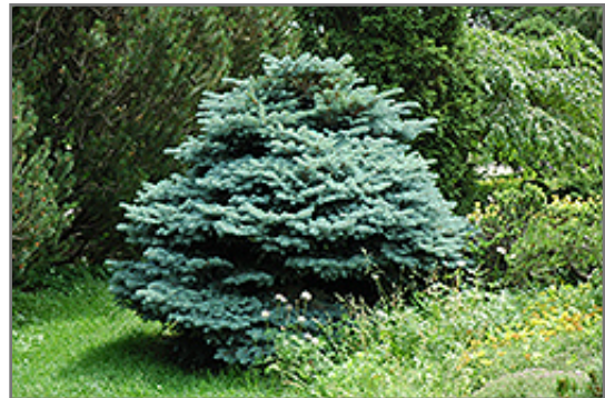
Globe Blue Spruce