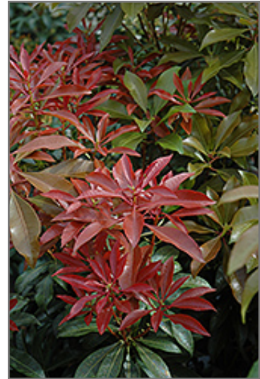
Mountain Fire Japanese Pieris in spring