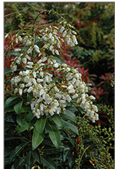
Mountain Fire Japanese Pieris flowers