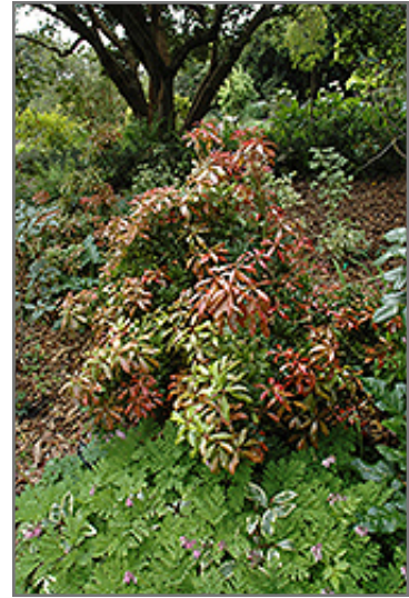
Mountain Fire Japanese Pieris

This shrub does best in full sun to partial shade. It requires an evenly moist well-drained soil for optimal growth, but will die in standing water. It is very fussy about its soil conditions and must have rich, acidic soils to ensure success, and is subject to chlorosis (yellowing) of the foliage in alkaline soils. It is somewhat tolerant of urban pollution, and will benefit from being planted in a relatively sheltered location. Consider applying a thick mulch around the root zone in winter to protect it in exposed locations or colder microclimates. This is a selected variety of a species not originally from North America, and parts of it are known to be toxic to humans and animals, so care should be exercised in planting it around children and pets.