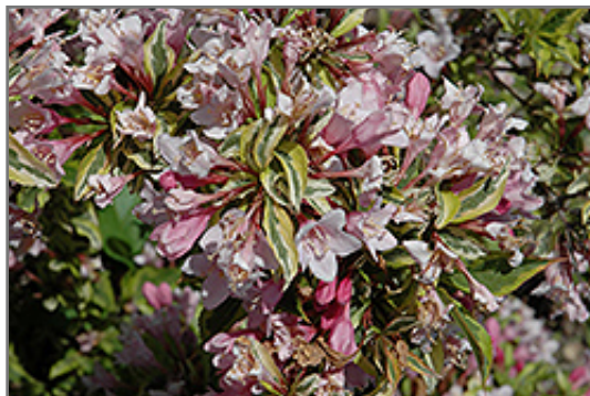
Rainbow Sensation Weigela flowers

Rainbow Sensation Weigela is recommended for the following landscape applications;