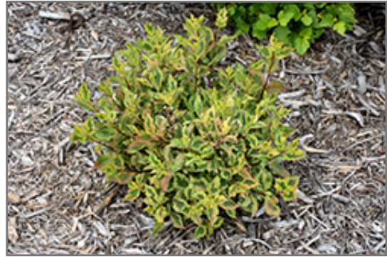
Rainbow Sensation Weigela

Rainbow Sensation Weigela makes a fine choice for the outdoor landscape, but it is also well-suited for use in outdoor pots and containers. Because of its height, it is often used as a 'thriller' in the 'spiller-thriller-filler' container combination; plant it near the center of the pot, surrounded by smaller plants and those that spill over the edges. It is even sizeable enough that it can be grown alone in a suitable container. Note that when grown in a container, it may not perform exactly as indicated on the tag - this is to be expected. Also note that when growing plants in outdoor containers and baskets, they may require more frequent waterings than they would in the yard or garden.