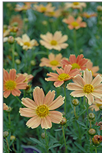
Sienna Sunset Tickseed flowers

Sienna Sunset Tickseed is recommended for the following landscape applications;