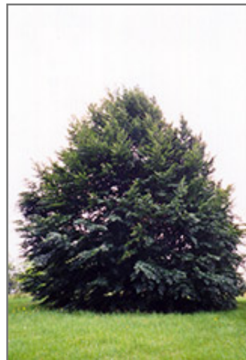
European Beech