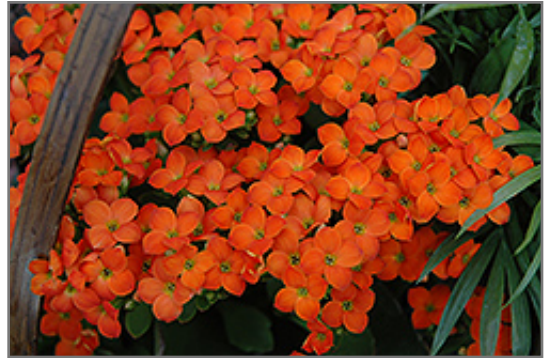
Sarah Kalanchoe flowers