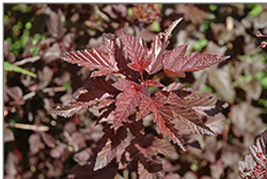
Lady In Red Ninebark foliage

Lady In Red Ninebark is recommended for the following landscape applications;