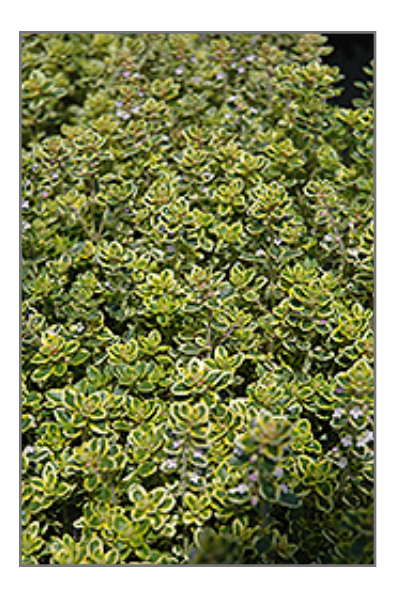
Lemon Thyme foliage

Lemon Thyme is smothered in stunning spikes of lilac purple flowers rising above the foliage from early to late summer. Its attractive tiny fragrant round leaves remain light green in color throughout the year.