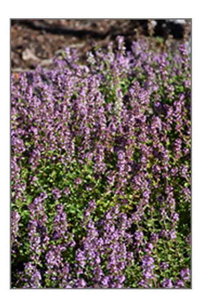
Lemon Thyme flowers