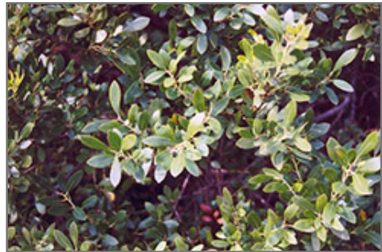
Ivory Queen Inkberry Holly foliage