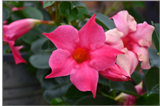
Pink Mandevilla flowers

This plant does best in full sun to partial shade. It requires an evenly moist well-drained soil for optimal growth. It is not particular as to soil type or pH. It is highly tolerant of urban pollution and will even thrive in inner city environments. This particular variety is an interspecific hybrid, and parts of it are known to be toxic to humans and animals, so care should be exercised in planting it around children and pets. It can be propagated by cuttings; however, as a cultivated variety, be aware that it may be subject to certain restrictions or prohibitions on propagation.