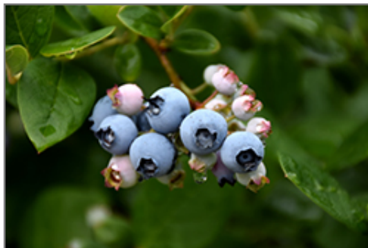
Elliott Blueberry fruit

Elliott Blueberry features dainty clusters of white bell-shaped flowers with shell pink overtones hanging below the branches in mid spring. It has green deciduous foliage. The glossy oval leaves turn yellow in fall. It features an abundance of magnificent blue berries from late summer to early fall. The smooth brick red bark adds an interesting dimension to the landscape.