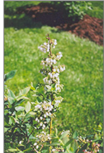
Elliott Blueberry flowers

This shrub is typically grown in a designated area of the yard because of its mature size and spread. It does best in full sun to partial shade. It does best in average to evenly moist conditions, but will not tolerate standing water. It is very fussy about its soil conditions and must have sandy, acidic soils to ensure success, and is subject to chlorosis (yellowing) of the foliage in alkaline soils. It is quite intolerant of urban pollution, therefore inner city or urban streetside plantings are best avoided, and will benefit from being planted in a relatively sheltered location. Consider applying a thick mulch around the root zone in winter to protect it in exposed locations or colder microclimates. This is a selection of a native North American species.