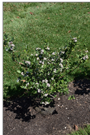
Elliott Blueberry fruit