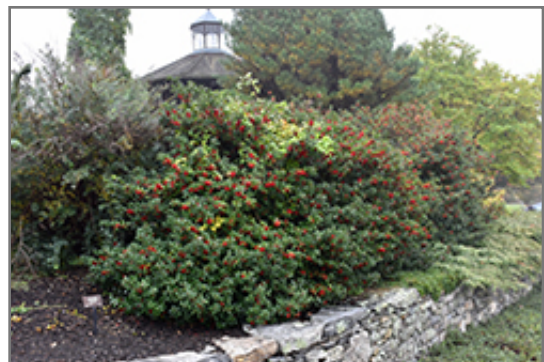
Blue Princess Meserve Holly fruit