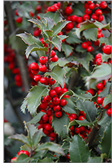
Blue Princess Meserve Holly fruit

Blue Princess Meserve Holly is recommended for the following landscape applications;