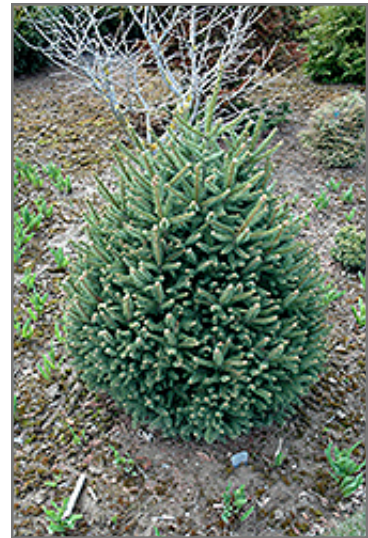
Arnold Dwarf Norway Spruce

Arnold Dwarf Norway Spruce will grow to be about 4 feet tall at maturity, with a spread of 4 feet. It tends to fill out right to the ground and therefore doesn't necessarily require facer plants in front. It grows at a slow rate, and under ideal conditions can be expected to live for 50 years or more.