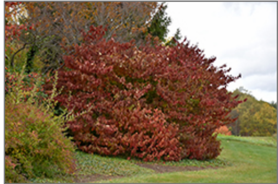
Doublefile Viburnum in fall

This shrub does best in full sun to partial shade. It does best in average to evenly moist conditions, but will not tolerate standing water. It is not particular as to soil type or pH. It is highly tolerant of urban pollution and will even thrive in inner city environments. This is a selected variety of a species not originally from North America.