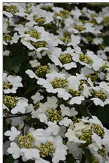
Doublefile Viburnum flowers