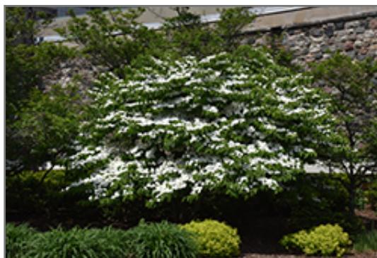
Doublefile Viburnum in bloom

This is a relatively low maintenance shrub, and should only be pruned after flowering to avoid removing any of the current season's flowers. It is a good choice for attracting birds to your yard, but is not particularly attractive to deer who tend to leave it alone in favor of tastier treats. It has no significant negative characteristics.