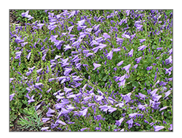
Birch Hybrid Bellflower in bloom