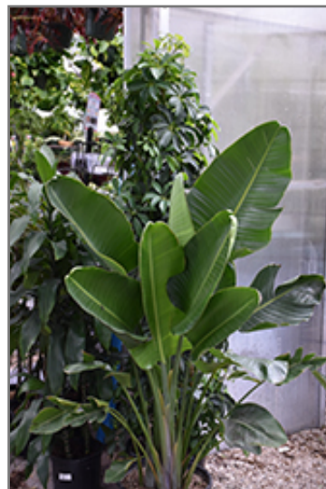
White Bird Of Paradise