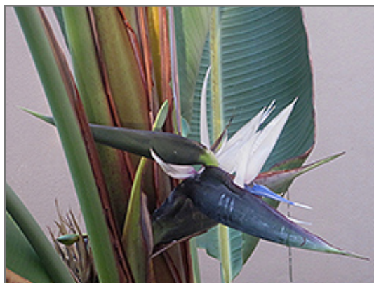
White Bird Of Paradise flowers

This is a multi-stemmed evergreen houseplant with an upright spreading habit of growth. Its wonderfully bold, coarse texture is quite ornamental and should be used to full effect. You may trim off the flower heads after they fade and die to encourage repeat blooming.