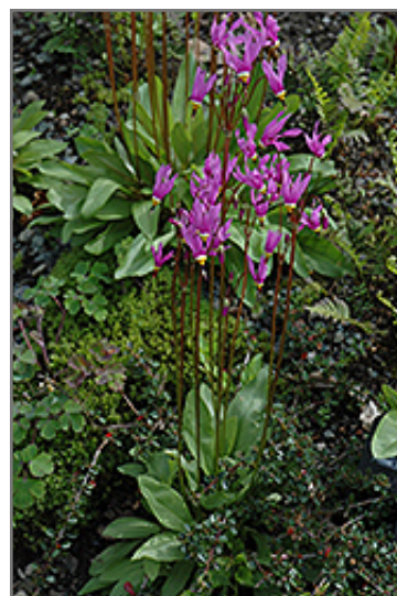
Shooting Star in bloom