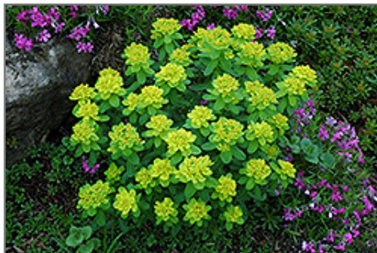
Cushion Spurge in bloom

Cushion Spurge is recommended for the following landscape applications;