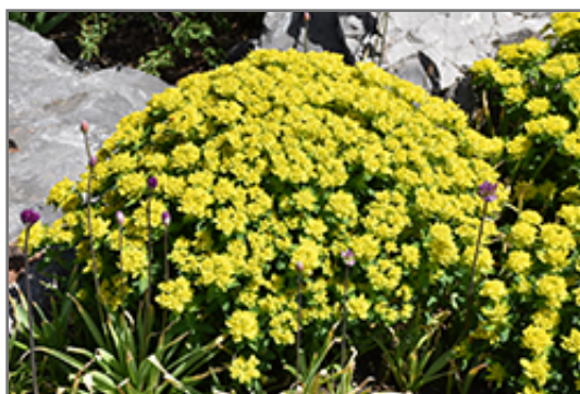
Cushion Spurge in bloom