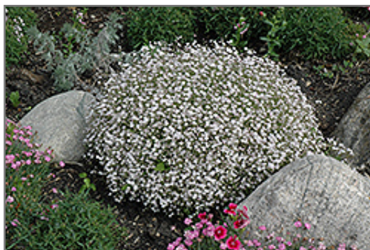
Creeping Baby's Breath in bloom