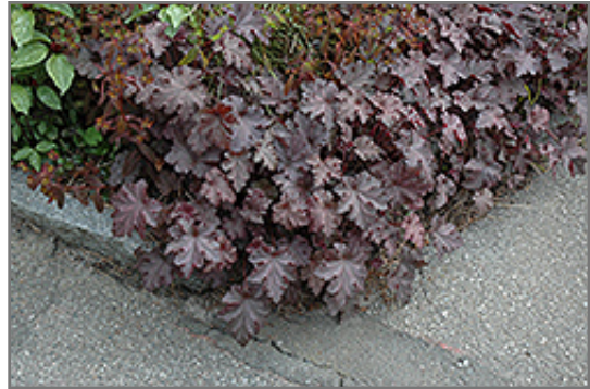
Stormy Seas Coral Bells

Stormy Seas Coral Bells is recommended for the following landscape applications;