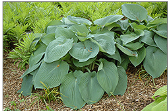
Blue Mammoth Hosta