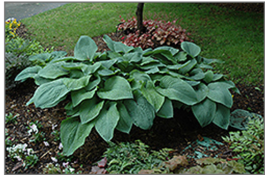
Blue Mammoth Hosta

Blue Mammoth Hosta is recommended for the following landscape applications;