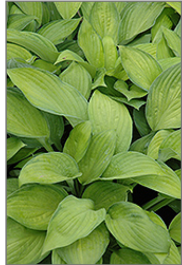
Gold Standard Hosta foliage

Gold Standard Hosta is recommended for the following landscape applications;